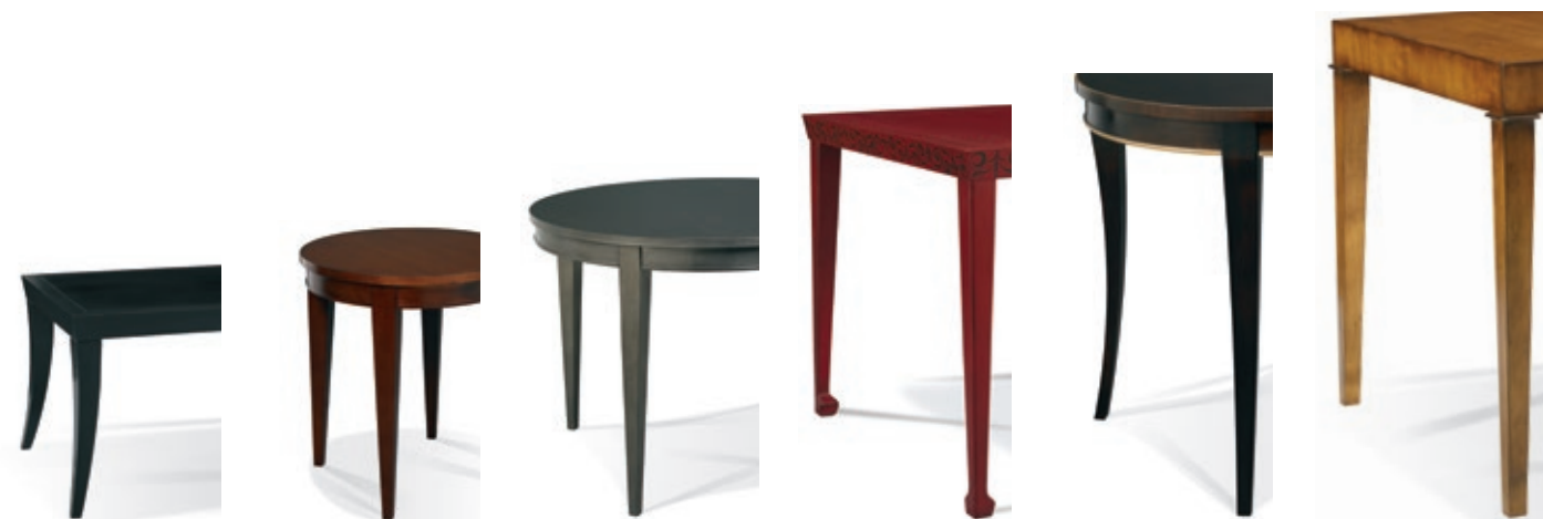
Cocktail 19"H End 26"H Console/Dining 30"H Console 34"H Counter 36"H Bar 42"H